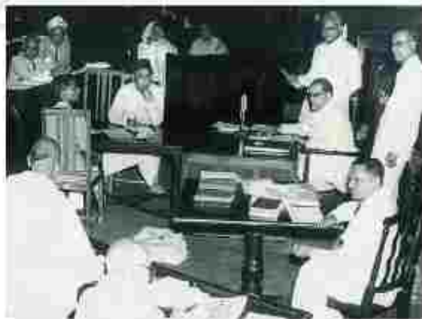
Dr. B.R. Ambedkar presiding over a discussion in the Constituent Assembly

Dr. B.R. Ambedkar CAD, Vol. VII, p.37, 4 November 1948