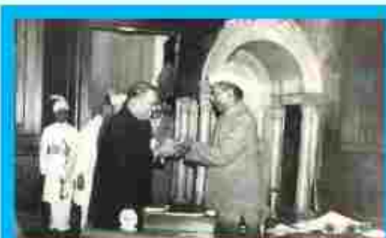
The President of the Constituent Assembly, Dr. Rajendra Prasad and the Chairman of the Drafting Committee, Dr. B.R. Ambedkar, greeting each other

Constituent Assembly, where each clause of the Constitution was subjected to scrutiny and debate, is a tribute to public reason at its best. These debates deserved to be memorialised as one of the most significant chapters in the history of constitution making, equal in importance to the French and American revolutions.